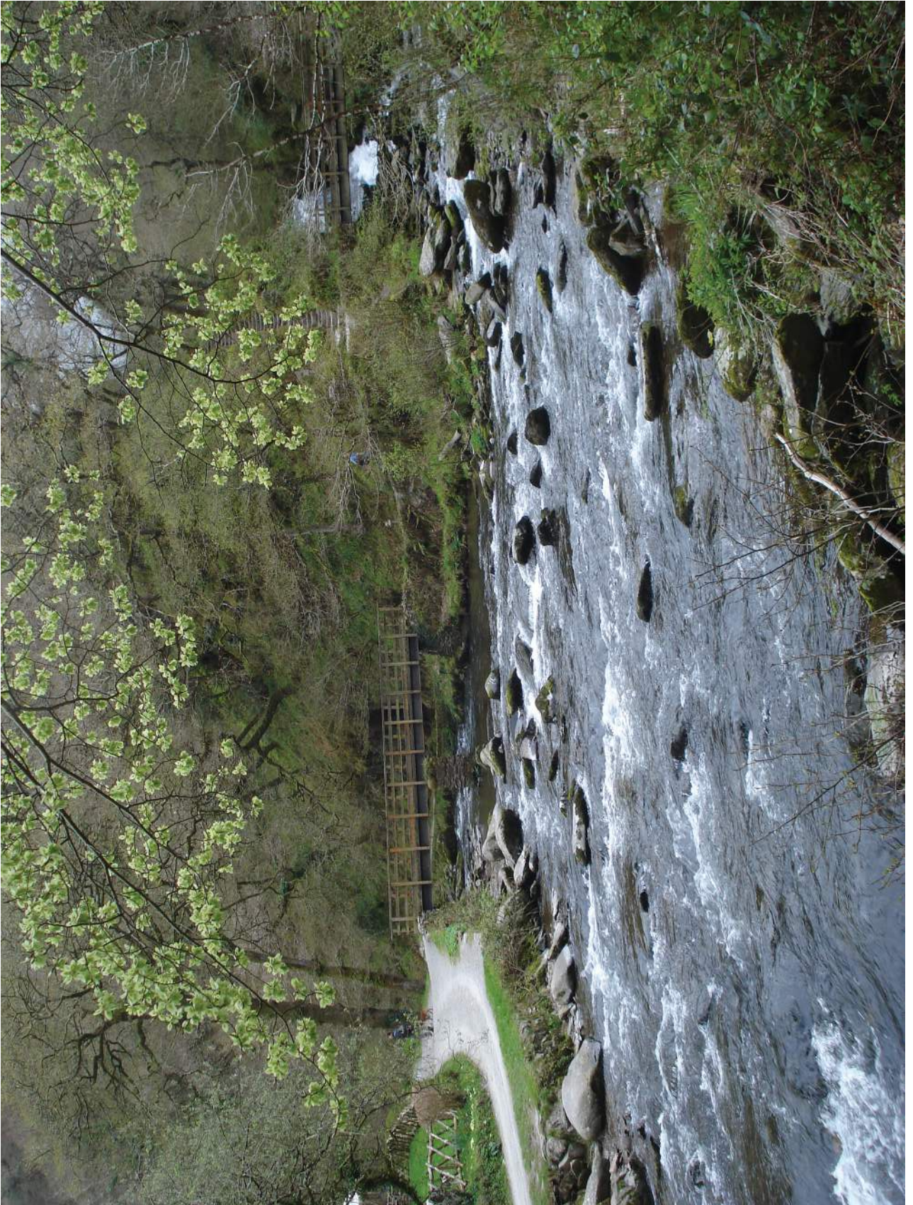
Fig. 3.1 for Question 3