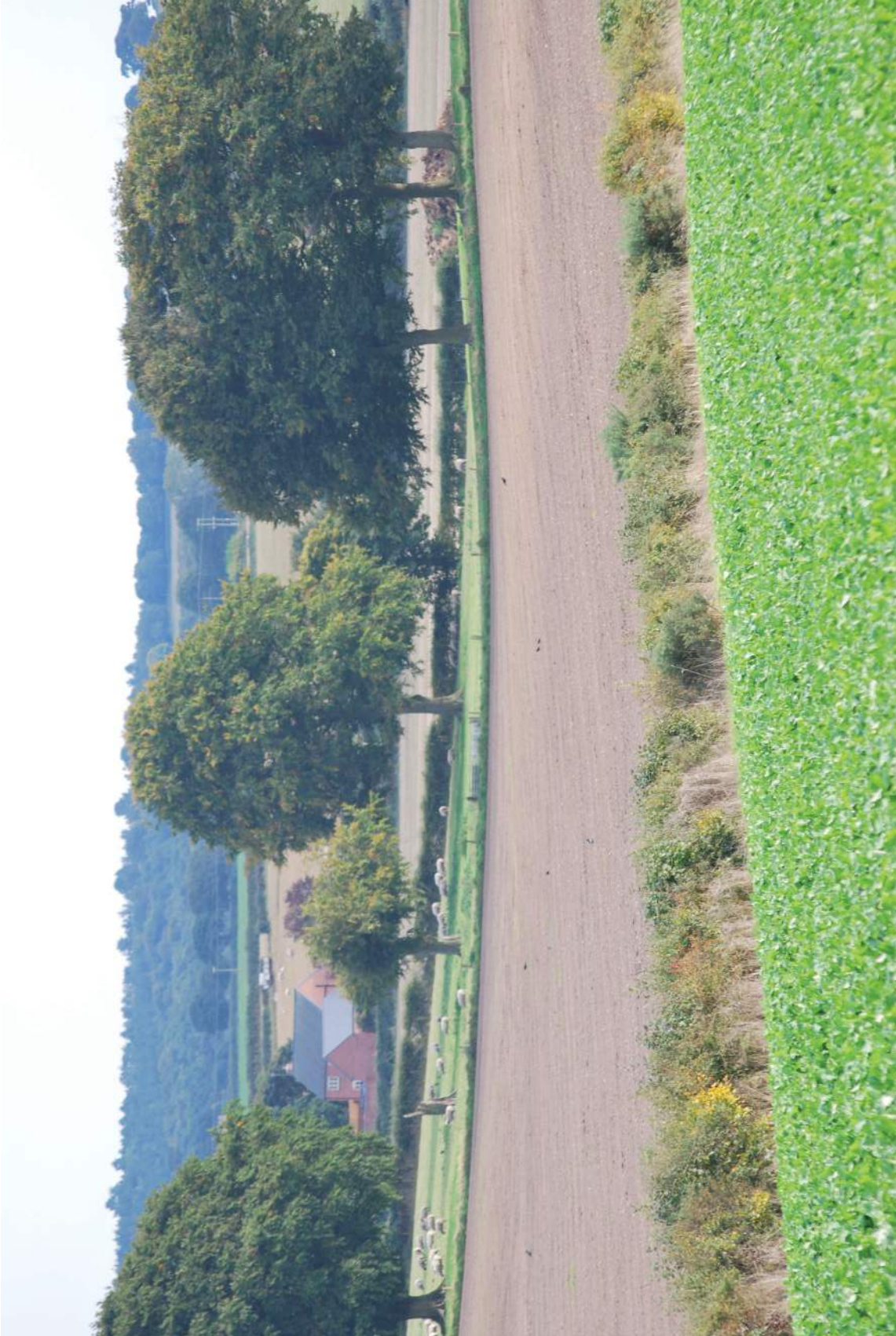
Fig. 5.2 for Question 5