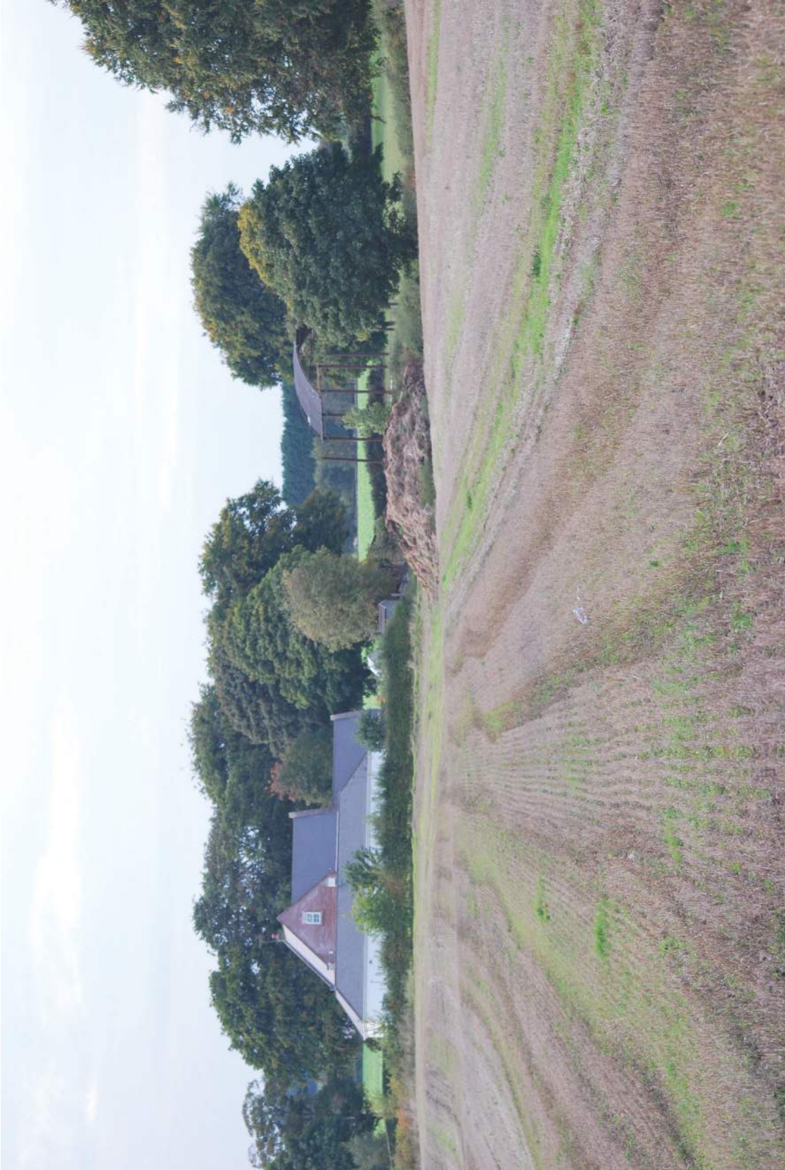
Fig. 5.3 for Question 5